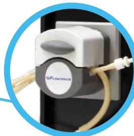
Seg-Flow Pump* 3a, 4a