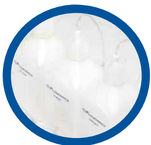
6 Reagent/Waste Bottle