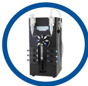
9 Sample-Mod 300