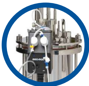
5 Vessel Tubing Assemblies

To keep your Seg-Flow® 4800 system at its best, Flownamics recommends periodic maintenance of the system. This will help to avoid issues such as tubing blockage, fluid delivery failure and incorrect fluid sensor readings that could prevent the Seg-Flow from successfully delivering a sample during a run.