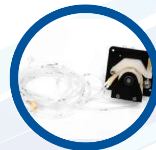
FlowFraction 400 Wash Pump 8