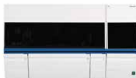
Roche Cedex BioHT