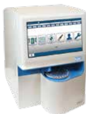
Nova Biomedical BioProfile FLEX2