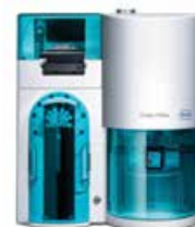
Roche Cedex HiRES