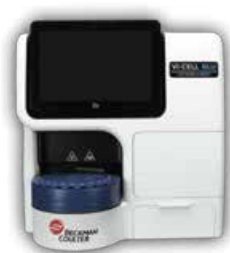
Beckman Coulter Vi-CELL BLU